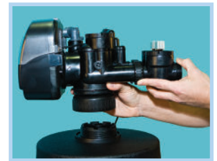
RAIN UD-60™ Gen II Control Valve Easy Disconnect