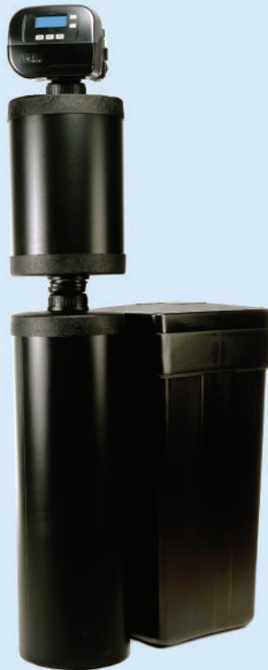
RAIN UD-60™ Gen II Stack Tank System with 15" x 17" x 36" brine tank